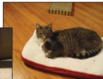
Left: Silver soaking up the sun. Above: Trouble lounging on his new bed.