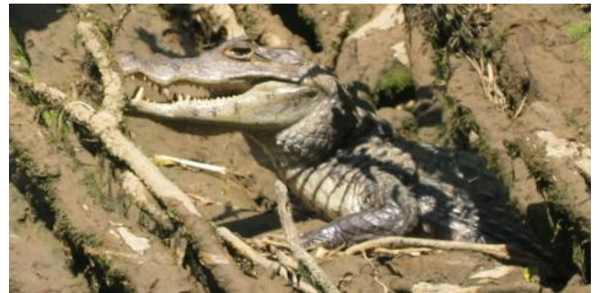
Caiman "freshwater alligator"

cloud forest to catch a glimpse of the elusive and rare resplendent Quetzal. Needless to say I highly recommend a trip to Costa Rica to anyone who is the least bit interested in a thrilling and rejuvenating animal adventure!