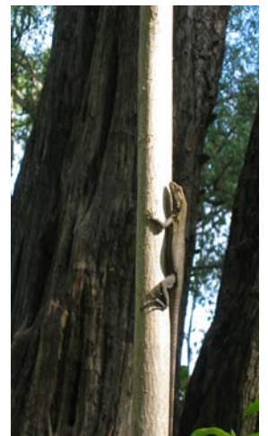
Unidentified Costa Rican Lizard